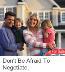
Don't Be Afraid To Negotiate.