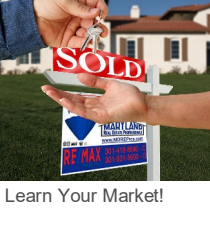
Learn Your Market!