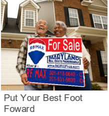
Put Your Best Foot Forward